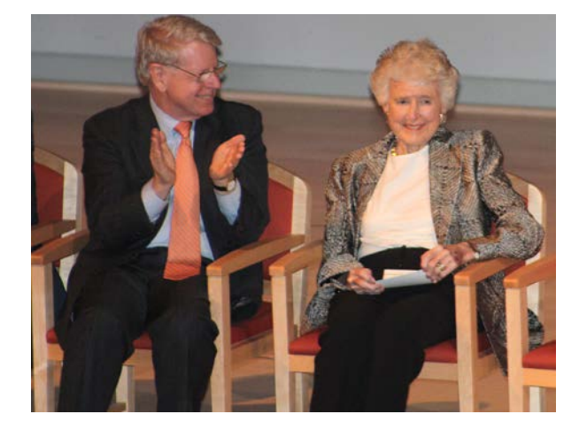
Never before have so many of the directors of the most important international research institutes in art history been together in Texas, and the occasion promises to be truly historic.

To celebrate this and to inaugurate the institute, we are bringing the Directors of the Institute of Fine Arts in New York, the Zentralinstitut fur Kunstgeschichte in Munich, the Clark Art Institute in Williamstown, Mass, and the Getty Research Center in Los Angeles to Dallas on October 29<sup>th</sup> and 30<sup>th</sup>.