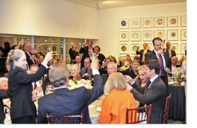
Inaugural toast at the DMA with distinguished guests.