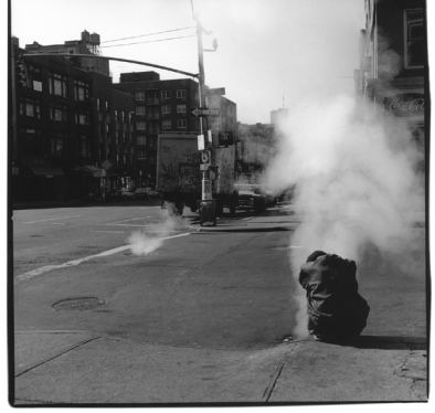
Image: Sylvia Plachy, Homeless in Chelsea, 1985, silver gelatin print, 15" x 15"

Image: Gyorgy Beck, Hood, 2010, mixed media, 9.75" x 9.75" x 2.375"