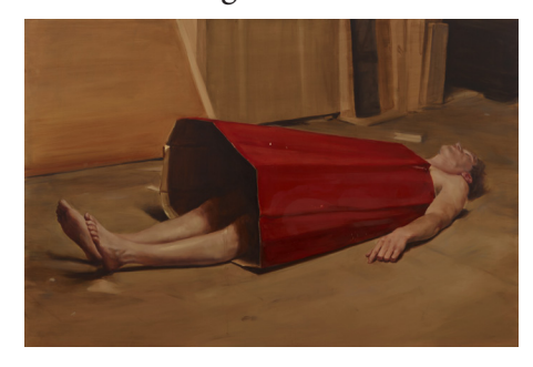
Michaël Borremans, The Devil's Dress, 2011, oil on canvas, Dallas Museum of Art, DMA/amfAR Benefit Auction Fund