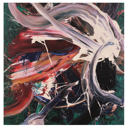
Kazuo Shiraga, Daiitokuson, 197, oil on canvas, Amagasaki City, courtesy Amagasaki Cultural Center © 2015 Shiraga Hisao