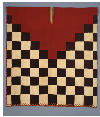
Inca: Conquests of the Andes

Inca: Conquests of the Andes explores the dynamic nature of state expansion and imperial conquest on Andean visual arts. The Inca Empire developed through the 15th and early 16th centuries, encompassing the central Andes of South America. Before and after the Inca Empire, political expansions by local states or foreign empires continually transformed the Andean coast and highlands. The visual arts of these periods reflect the dynamism of such cultural convergence. The exhibition presents more than 120 works primarily drawn from the DMA's collection, many of which are on view for the first time, along with significant loans. The Inca (Inka) and their imperial impact are framed by pre-Inca cultures, such as the Huari (Wari), and the successive early Spanish colonial period. The exhibition reflects the traditional media of Andean visual arts, from ceramic and wood to gold, silver, feather, and textile objects. They convey the richness and dynamism of over 1,000 years of Andean cultural history.