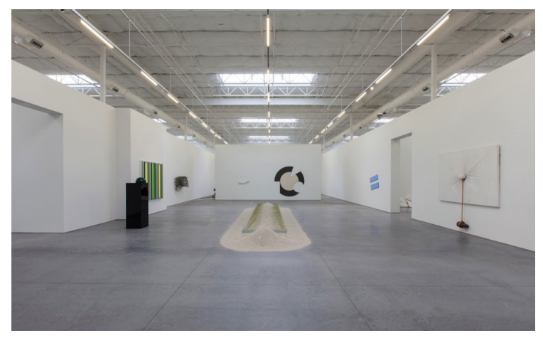
Geometries On and Off the Grid: Art from 1950 to the Present at The Warehouse.

Geometries On and Off the Grid: Art from 1950 to the Present examines geometry in the art of the postwar period and its evolution from an increasingly reductivist language in the 1950s and 60s to one that was re-envisioned in the 1960s and 70s as a means of reincorporating the figure and representations of identity into vanguard art. This history, which has been principally told from an American perspective, is explored here with the work of 112 artists from 18 countries in North America, Europe, Latin America, and Asia,