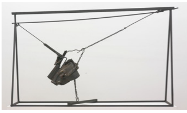
Melvin Edwards: Five Decades, Welded steel, 62 \times 102 \times 26 in. Williams College Museum of Art, Williamstown, Massachusetts; Museum Purchase. © 2015 Melvin Edwards / Artists Rights Society (ARS), New York

In January 2015, the Nasher Sculpture Center presents Melvin Edwards: Five Decades, a retrospective of the renowned American sculptor Melvin Edwards. Working primarily in welded steel, Edwards is perhaps best known for his Lynch Fragments, an ongoing series of small-scale reliefs born out of the social and political turmoil of the civil rights movement. Incorporating tools and other familiar objects, such as chains, locks, and ax heads, Edwards's Lynch Fragments are abstract yet evocative, summoning a range of artistic, cultural, and historical references.