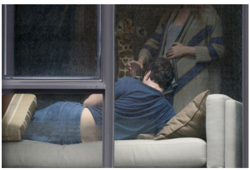
© Arne Svenson, Neighbors #52, 2012, Pigment print, Acquired in 2014, Collection of the Modern Art Museum of Fort Worth, Museum purchase, The Friends of Art Endowment Fund.