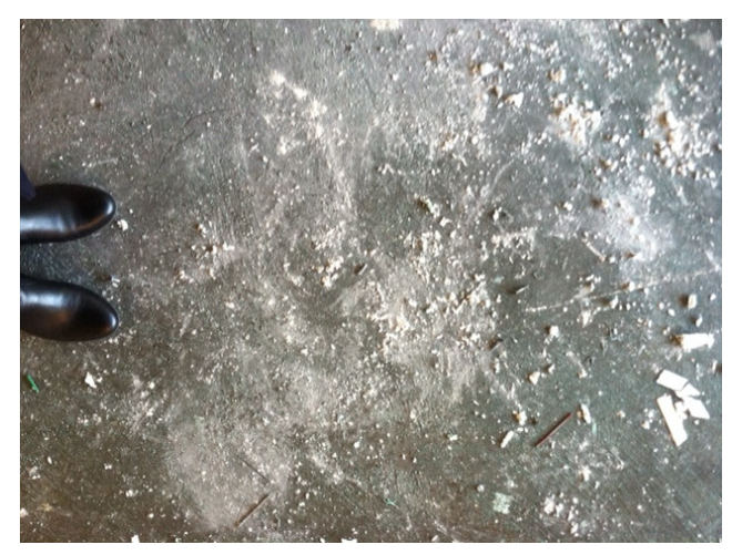
Site visit to the Edith O'Donnell Institute's UTD headquarters under construction on February 13, 2015.

The O'Donnell Institute was founded as a forum for scholarly research but also as a center for graduate study. To that end, we have begun to sketch out the contours of a new Master's program in art history that will be uniquely positioned to draw on the resources of a university, a research institute, area museums and private collections, and our ever-growing community of art historians and artists. The rich body of material-artworks, architecture, archives--close at hand here in North Texas will form the curriculum's cornerstone and constant point of reference. The curriculum will join this object-oriented approach with a practicum element in which students will curate exhibitions, deliver gallery lectures, collaborate with practicing artists, and conduct