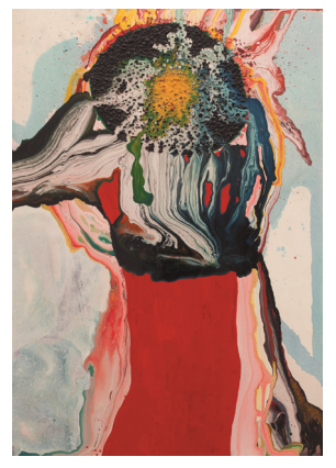
Sadamasa Motonaga, Work, 1963, oil and gravel on canvas, The Rachofsky Collection © 2015 Estate of Motonaga Sadamasa