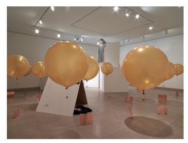
Installation of Concentrations 58: Chosil Kil, Dallas Museum of Art, 2015, Courtesy of Dallas Museum of Art