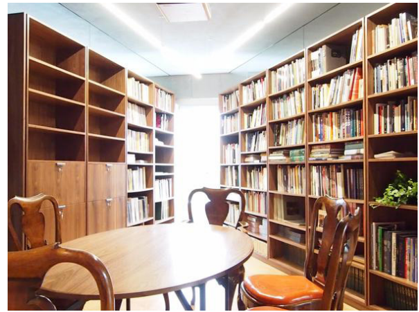
Photo of the almost finished EODIAH headquarters at the University of Texas at Dallas.