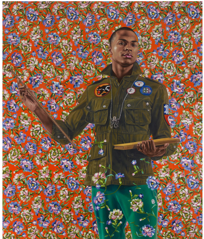
Anthony of Padua