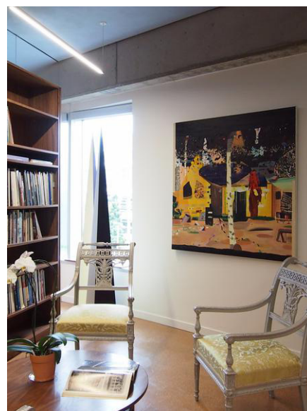
Director's Office at the EODIAH headquarters at UT Dallas.