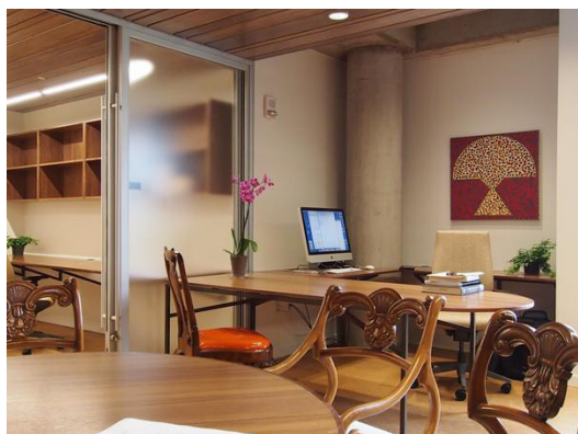
Office at the EODIAH headquarters at UT Dallas.

In the meantime, we are gearing up to welcome ten 2015-2016 research fellows to the O'Donnell Institute, where they will pursue projects on topics ranging from Byzantine icons to nineteenth-century landscape. They are introduced in this edition of the newsletter, and we hope you will have the chance to meet them and engage with their work.