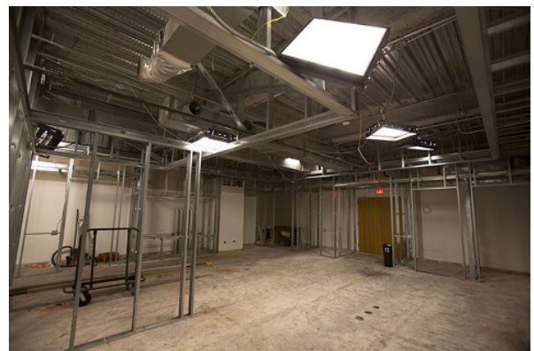
Progress on the downtown campus at the DMA.

Construction of the O'Donnell Institute's satellite offices at the Dallas Museum of Art are moving along on schedule, and will reach completion by November. Stay tuned for more information about December events to celebrate the opening.