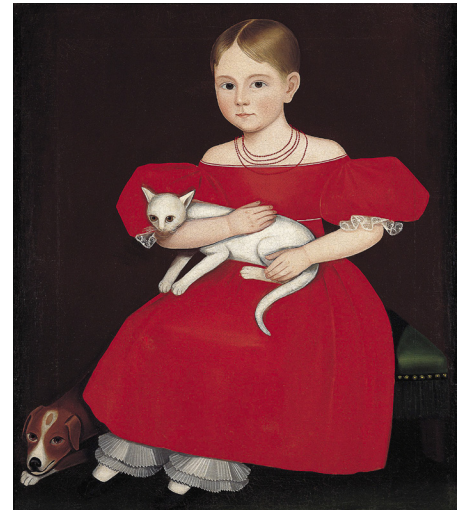
Ammi Phillips (1788–1865)

Girl in Red Dress with Cat and Dog , 1830–35 Oil on canvas, Collection American Folk Art Museum, New York, gift of Ralph Esmerian, 2001.37.1